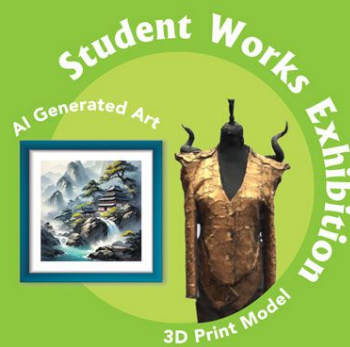
Student Works Exhibition AI Generated Art 3D Print Model