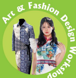
Art & Fashion Design Workshop